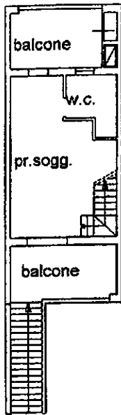
PIANO PRIMO H 2.80 mt.